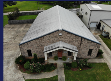
The New Life Women's Program Shelter

Third, we made shifts in the program and meeting locations to allow the women in the program to focus on their recovery more as well. Both in the warehouse and in the classroom, the women will be able to focus more on their recovery without outside distractions.