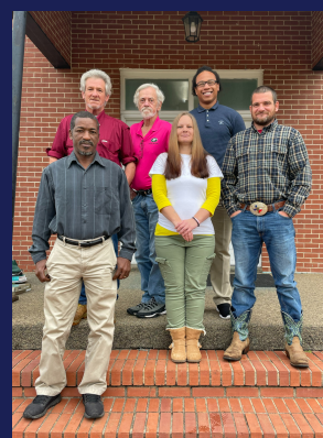
New Life Graduating Class 2021-2